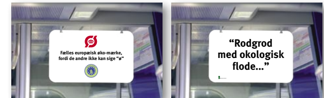
Signs in buses